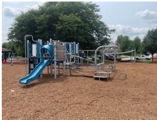
Spring Creek Estates Park