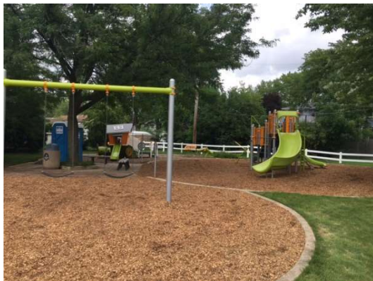
Bill Young Park