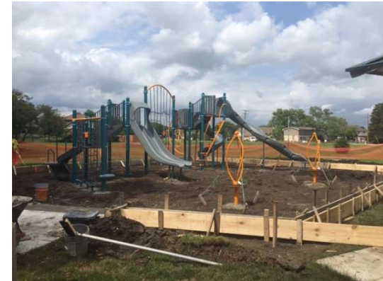
Wedgewood Estates Park