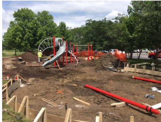
Cameno Real Park