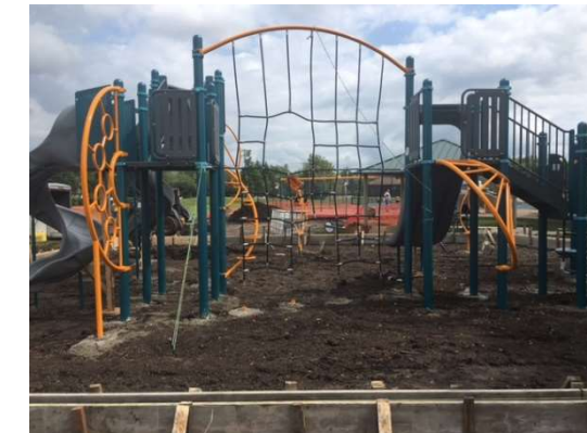
Wedgewood Estates Park