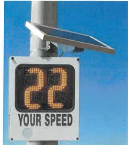
PMD 18 with solar panel option