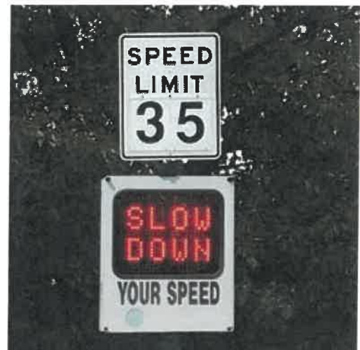
PMD 18 with red LED Slow Down Alert