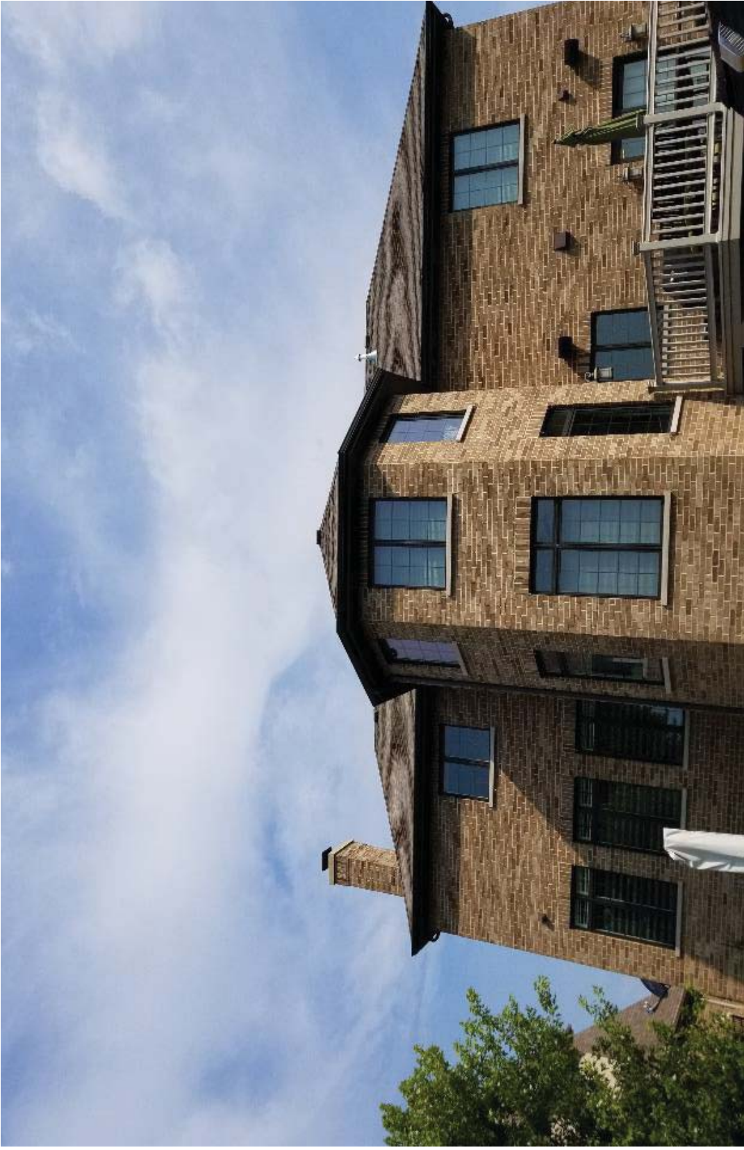
Image of Back of Home