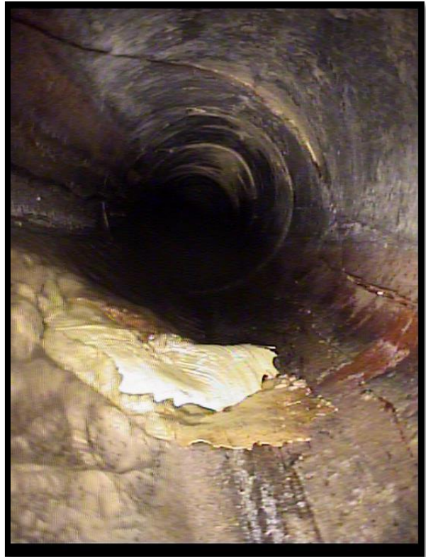
Future Collapse of Pipe