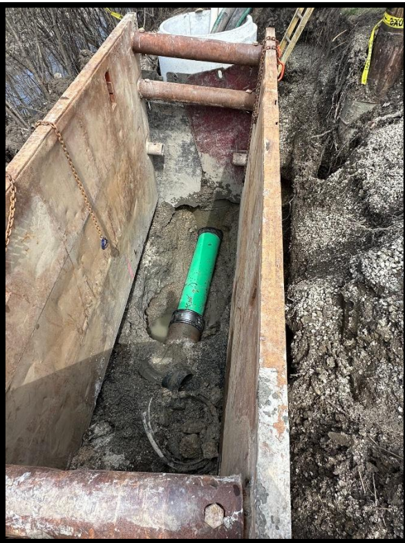
Southwest Highway Pipe Repair