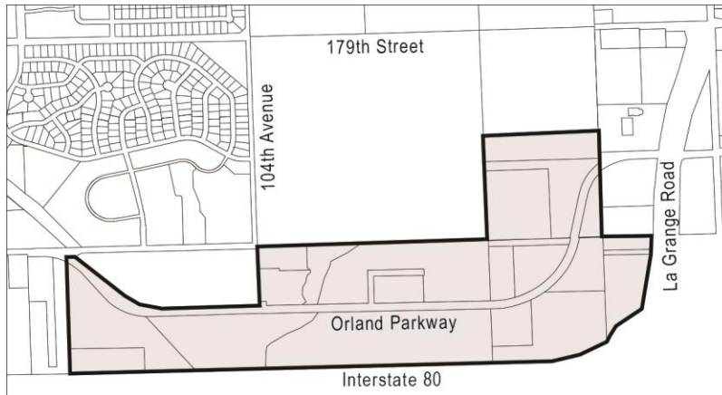
Map 6-214.B.1: Regional Mixed-Use Campus District (RMC) Map Boundary

The RMC District includes properties within the area loosely bordered by LaGrange Road on the east, Interstate 80 to the south, 107th Avenue to the west, and certain parcels on the north side of Orland Parkway.