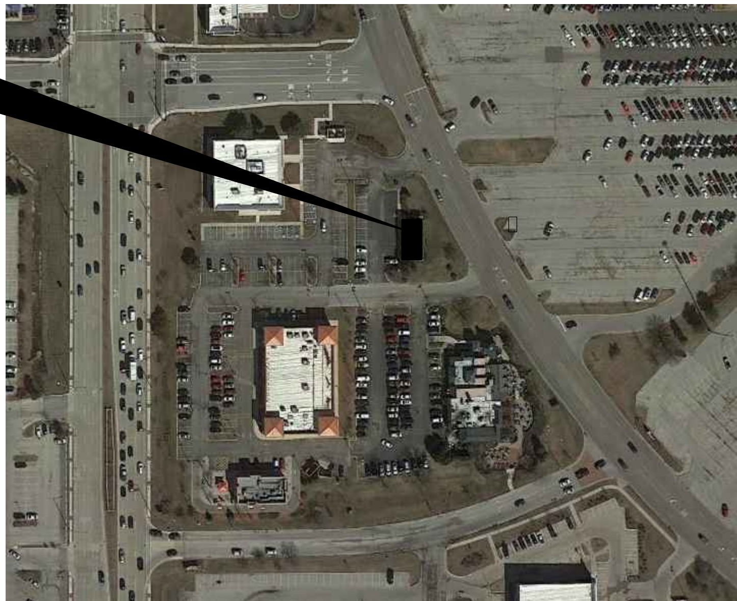
A LOCATION MAP DD-1 SCALE: NOT TO SCALE