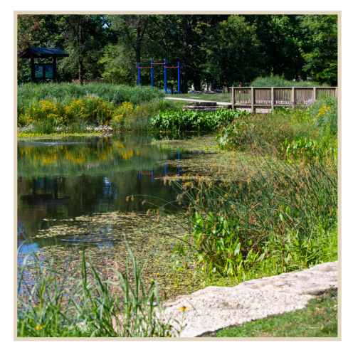
Rathje Park in Wheaton included two acres of native seeding and 3,000 native plant plugs. V3 is providing long-term native area maintenance for the site.

IDNR-OWR Permit (Floodway Control Permit)