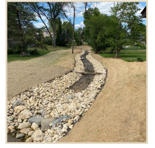
St. Joseph Creek design/build project for Downers Grove included native vegetation slope with rip rap toe.

Property easements will be critical for access, constructability and long-term maintenance. V3's survey will define property lines and indicate the required easement for each property along the stream corridor. The easement language will need to address both the limits needed for construction, but also the required space for access. This access area can be defined as usable space outside the stabilization measures; however it must also be clear that this area is to remain free for future access of maintenance activities.