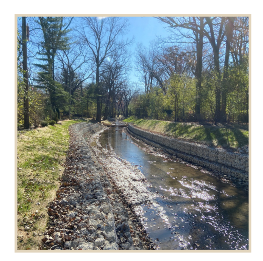
V3 designed, permitted and constructed the streambank stabilization along two linear miles of the Skokie River in Lake Forest which included gabion walls, native vegetation, stone toe, bank reshaping, grading and drainage repairs.

V3 has relied on the engineering plan set prepared by Michael Baker Jr, Inc. for the basic components of the proposed design. However, due to the age of this design plan it is critical to obtain a new topographic survey and conduct an assessment of the current stream condition. The reality of streambank erosion is that once the banks start to deteriorate the condition will continue to be exacerbated by normal flows and worsen with each storm event. Providing accurate information as close to the start of construction is critical for a successful project.