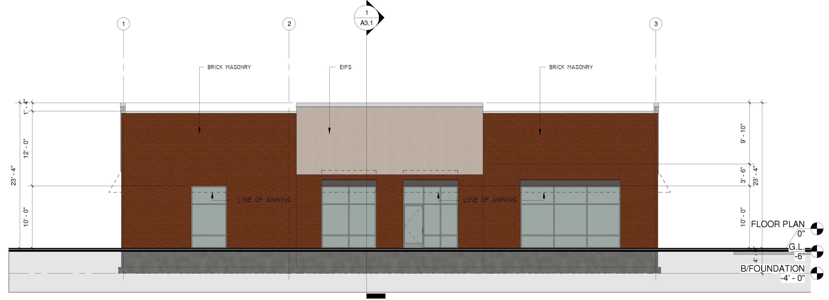
2 SOUTH ELEVATION 1/8" = 1'-0"