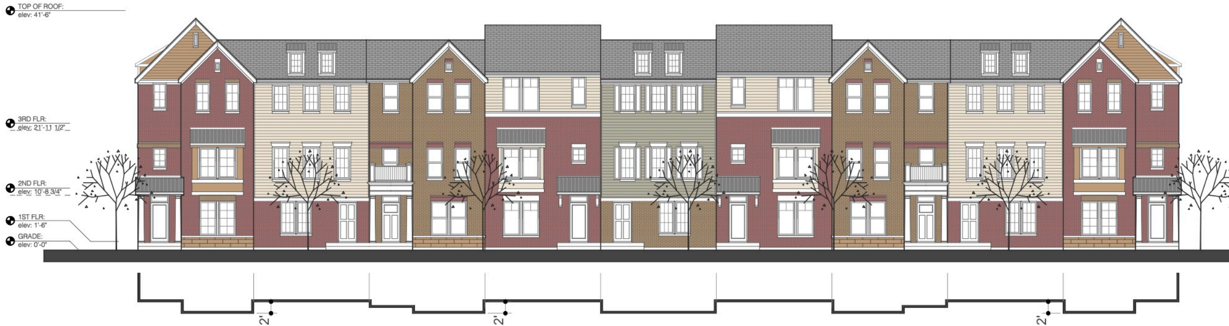
○ FRONT ELEVATION - BUILDING A (similar for all other front units on buildings B,C,D,E,F,G,H) SCALE: 1/16" = 1'-0"