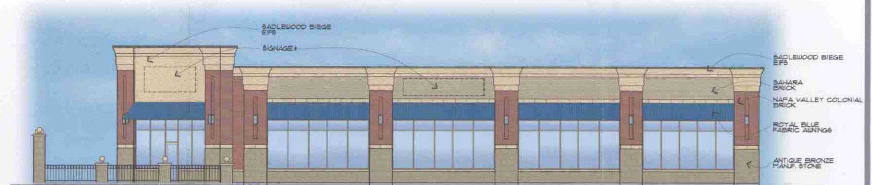
SOUTH ELEVATION SCALE: 1/8"=1'-0"