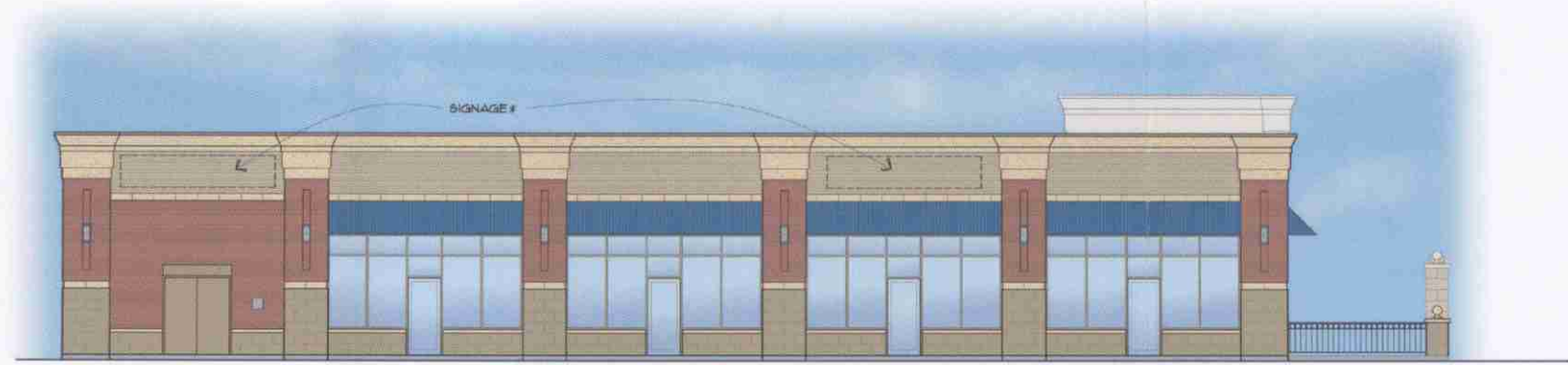
NORTH ELEVATION SCALE: 1/8"=1'-0"

BOARD APPROVED CASE NO. 2007-0642.2 DATE 12-17-07 W/CONDITIONS W/O CONDITIONS