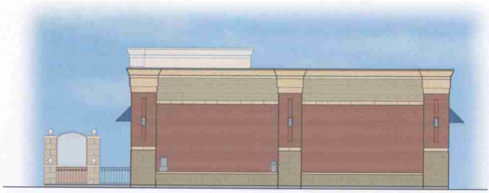
EAST ELEVATION SCALE: 1/8"=1'-0"