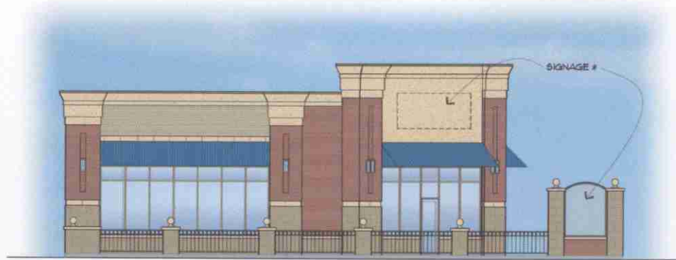
WEST ELEVATION SCALE: 1/8"=1'-0"