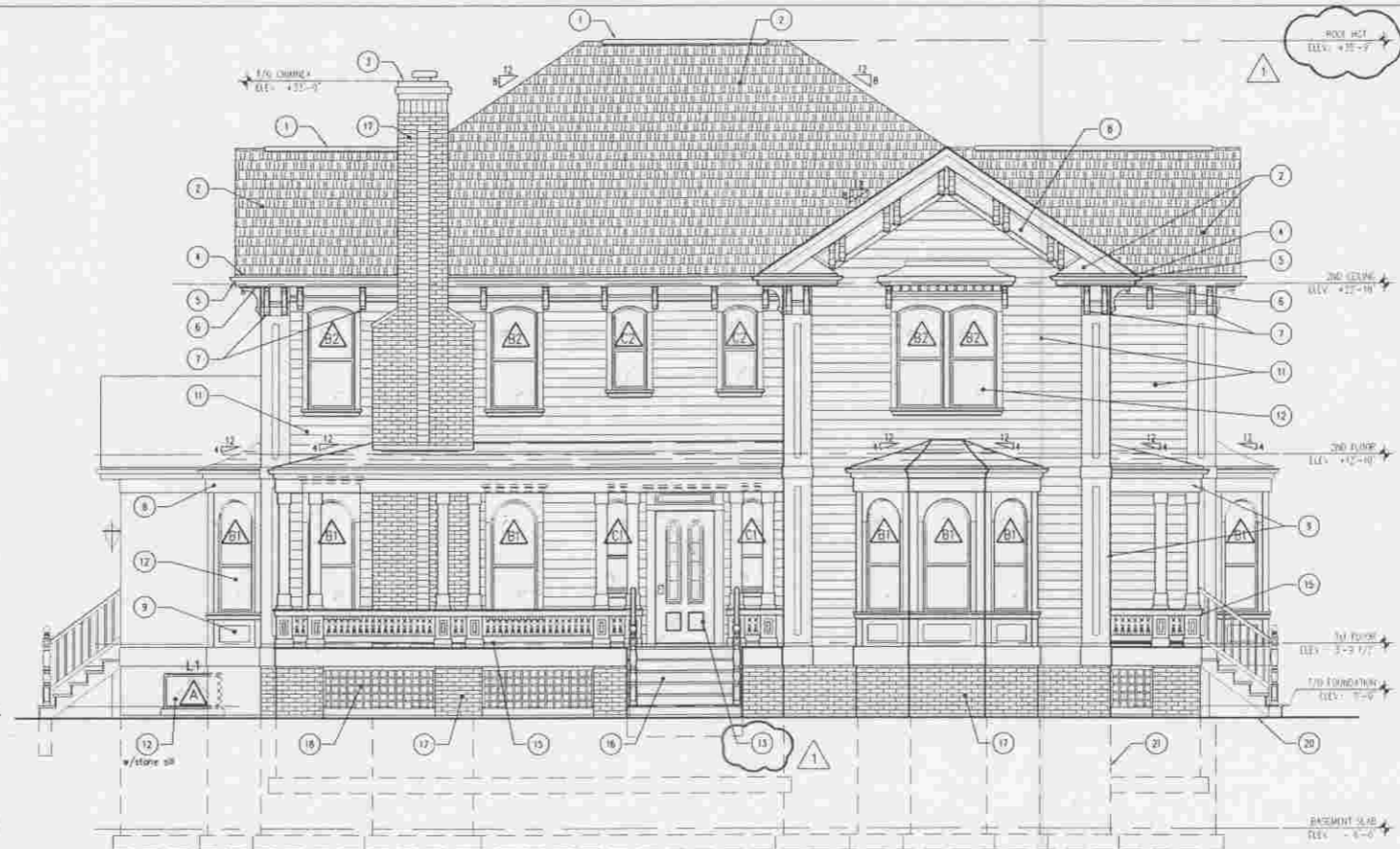
1 WEST ELEVATION - SIDE