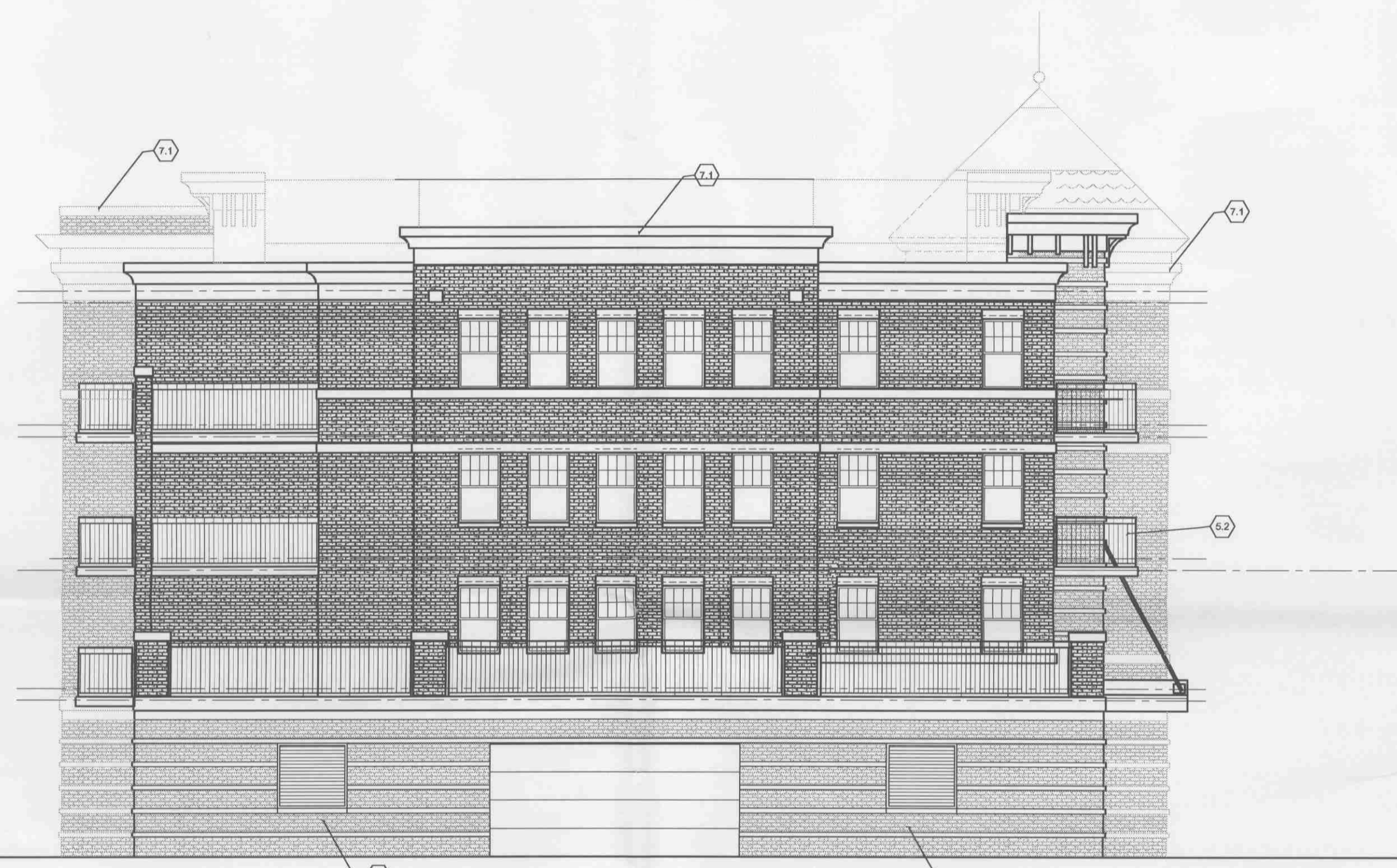
WEST BUILDING ELEVATION