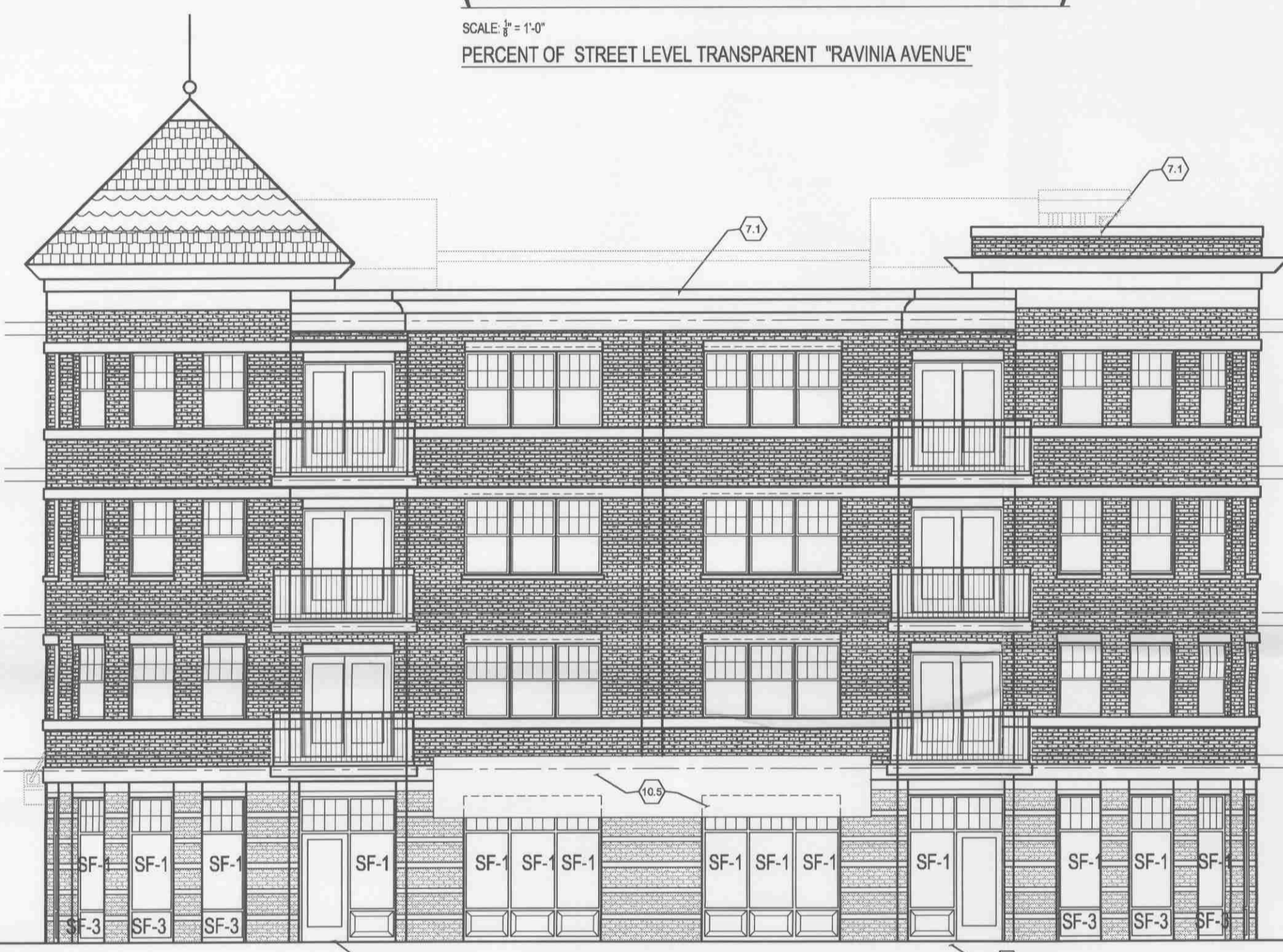
EAST BUILDING ELEVATION (RAVINIA AVENUE "STREET ELEVATION")

SCALE: 1/8" = 1'-0" PERCENT OF STREET LEVEL TRANSPARENT "RAVINIA AVENUE"