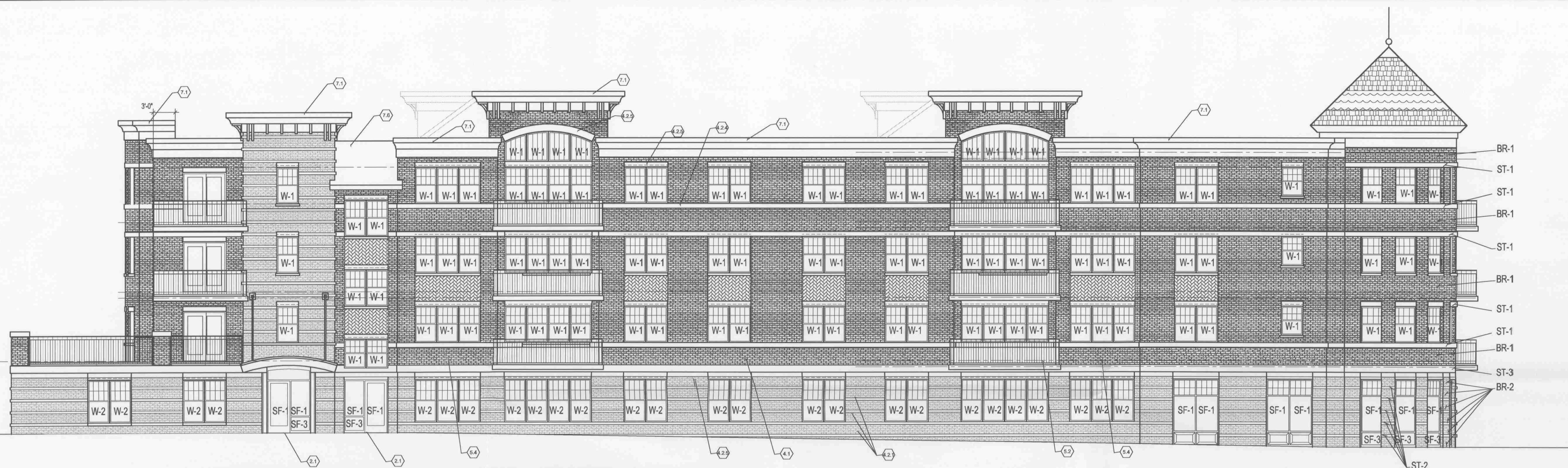
SOUTH BUILDING ELEVATION (ALTERNATE PARAPET DESIGN) (RAVINIA LANE "STREET ELEVATION")

SCALE: 1/8" = 1'-0" PERCENT OF STREET LEVEL TRANSPARENT "RAVINIA AVENUE"