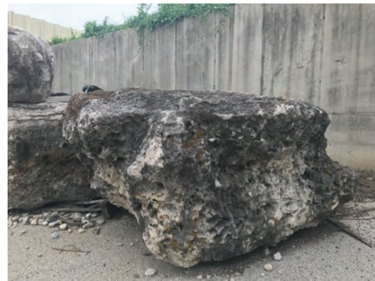
WEATHERED ROCK OUTCROPPING