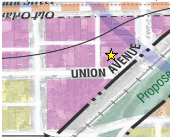
Comprehensive Plan Land Use Map