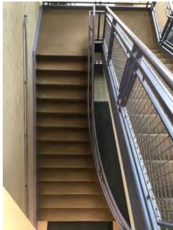
existing sportsplex stair