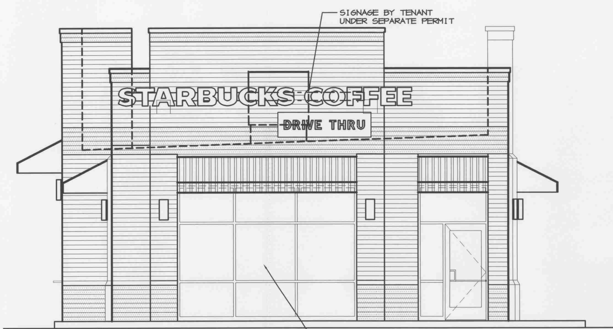
1 NORTH ELEVATION A4 1/4" = 1'-0"

1" INSULATED CLEAR GLASS THERMAL BREAK ALUMINUM STOREFRONT