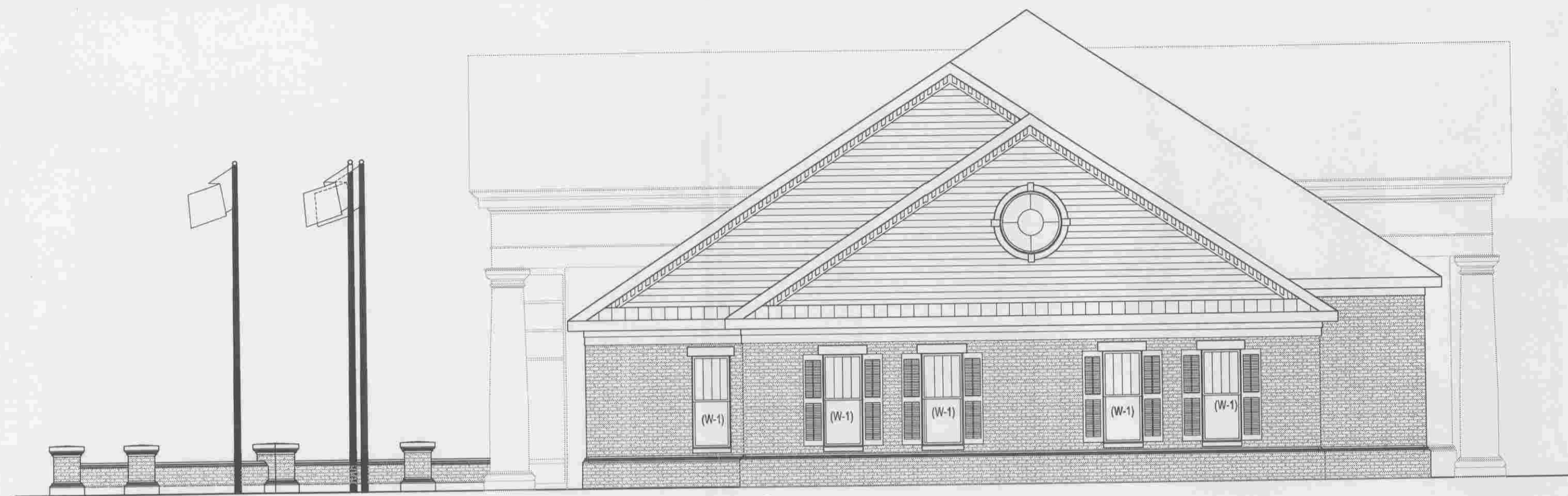
West Side Elevation

at 159th Street and Raviana Avenue Orland Park, Illinois