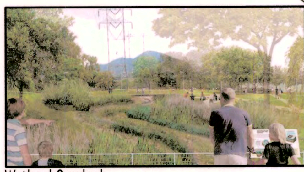
Wetland Overlook