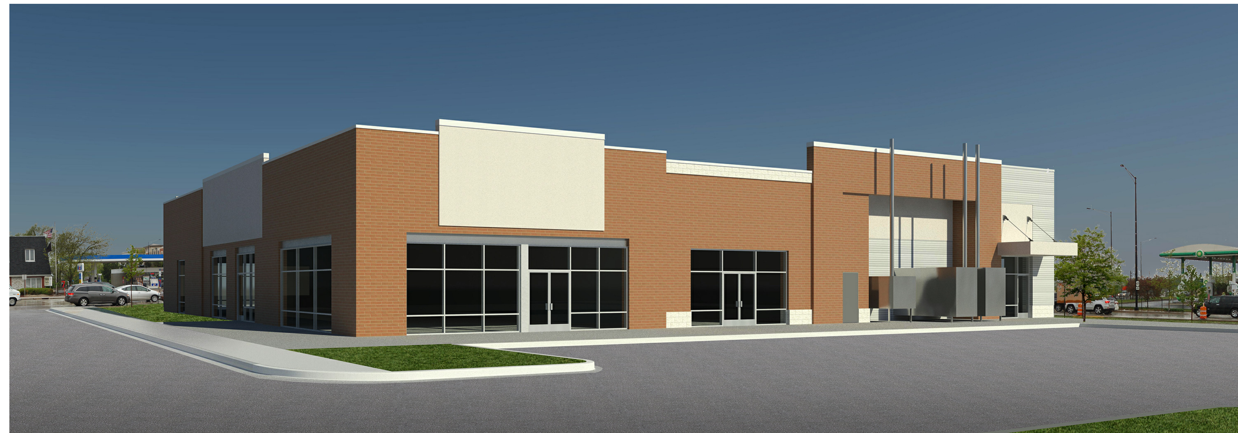
VIEW FROM SOUTHEAST