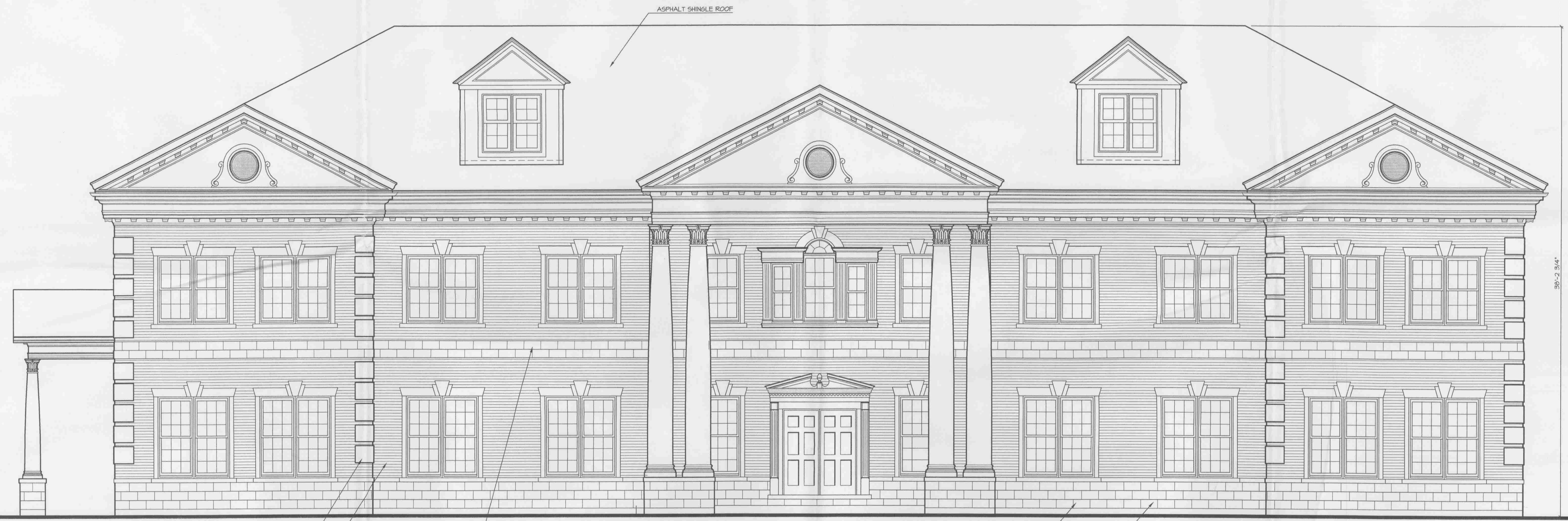
WEST ELEVATION (FRONT) 1/4"=1'-0"