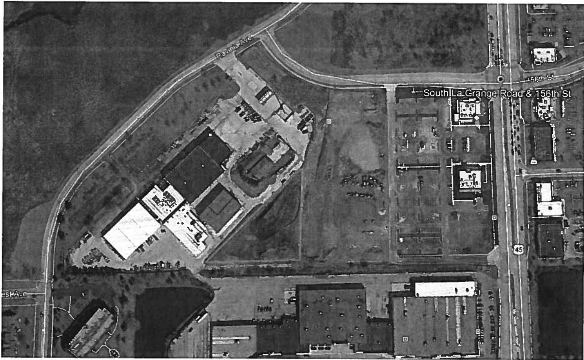
Figure 1. Approximate Site Location