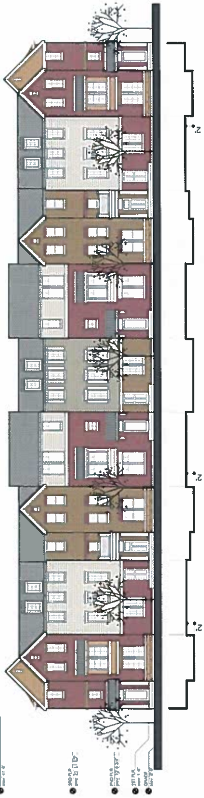
○ FRONT ELEVATION - BUILDING A (similar for all other front units on buildings B,C,D,E,F,G,H) SCALE: 1/16" = 1'-0"

Sheet Title PRELIMINARY ELEVATIONS SK2 Sheet No.