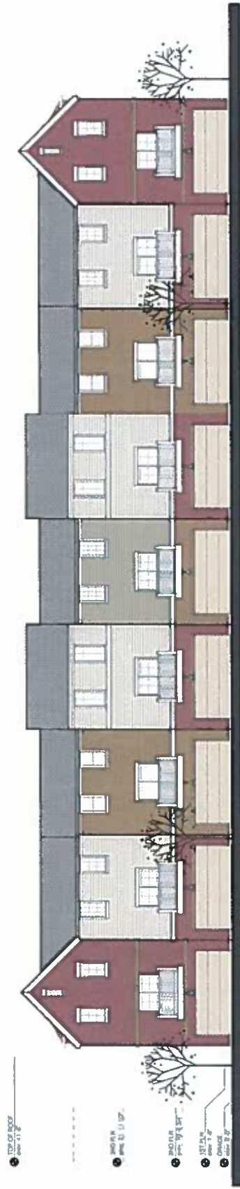
REAR ELEVATION - BUILDING A (similar for all other rear units on buildings B, C, D, E, F, G, H)