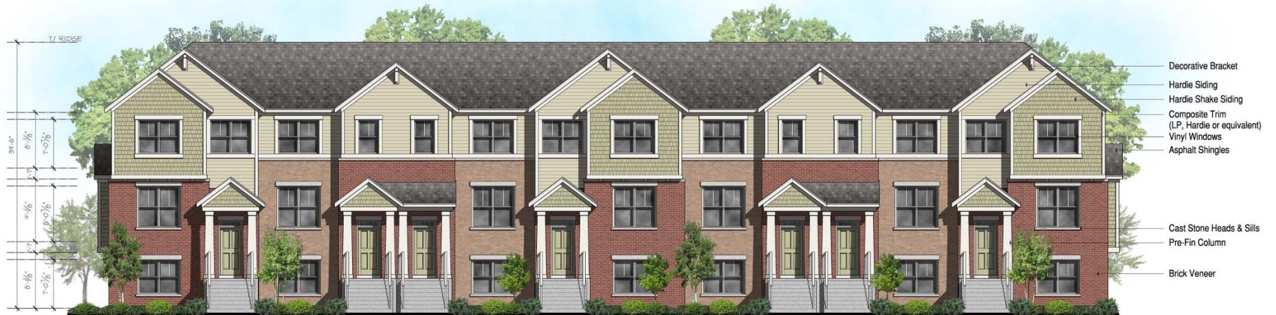
Front Elevation scale: 3/16" = 1'-0"