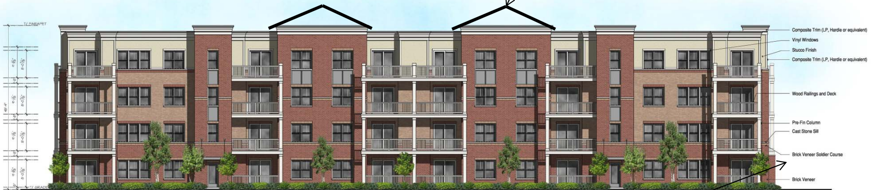
Rear Elevation scale: 1/8" = 1'-0"