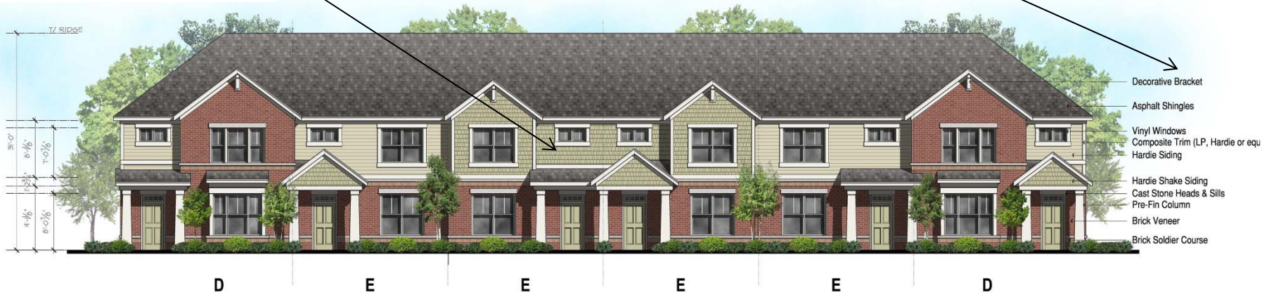
Front Elevation scale: 3/16" = 1'-0"