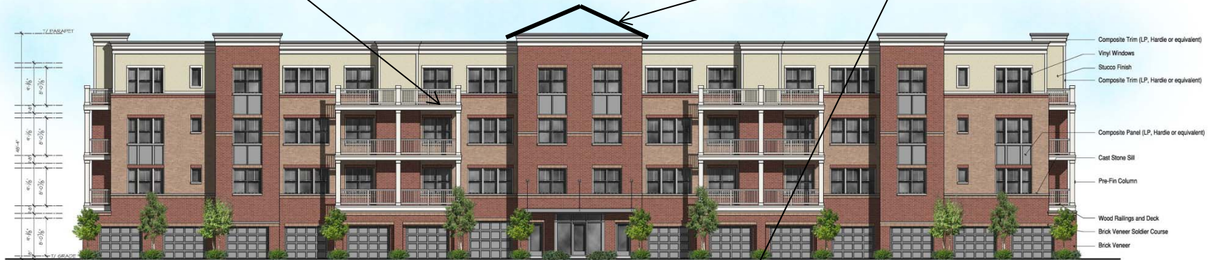
Front Elevation scale: 1/8" = 1'-0"