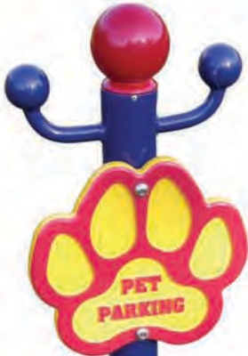
#6902 PET PARKING POST

626 128th St SW #104A 🐾 Everett, WA 98204 877-FIT-DOGS 🐾 www.dog-on-it-parks.com