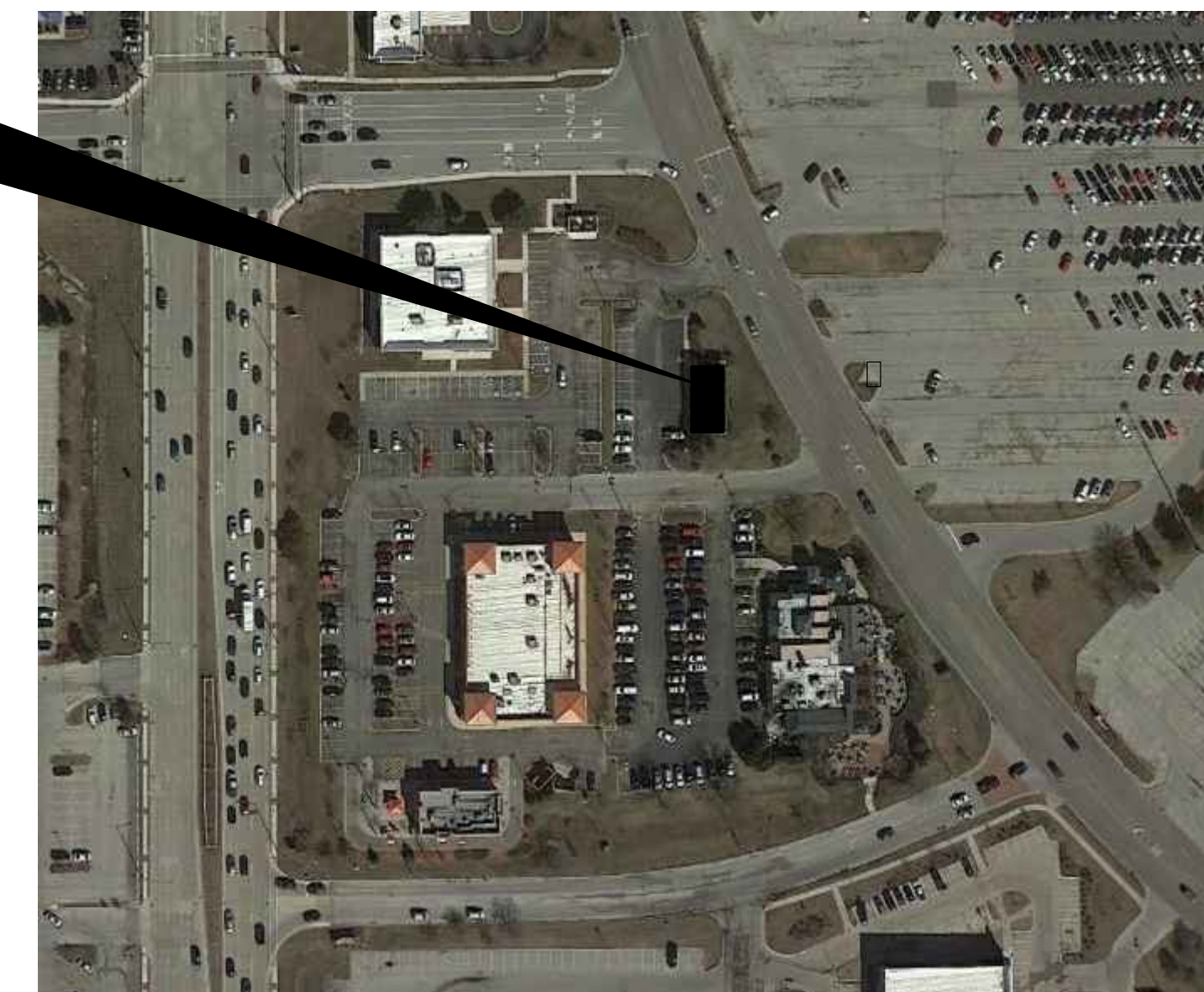
A LOCATION MAP DD-1 SCALE: NOT TO SCALE