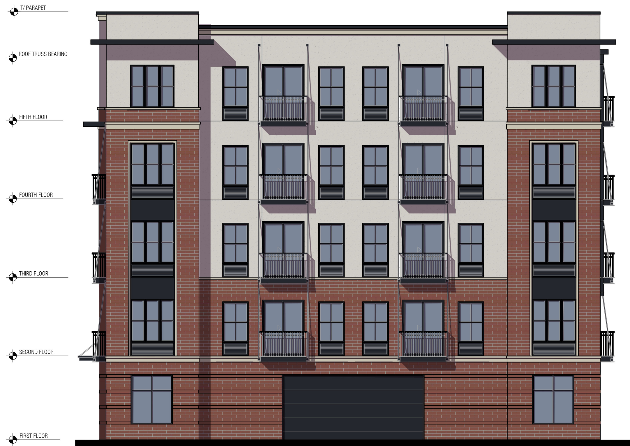
2 SIDE ELEVATION SCALE 1/8" = 1'-0"