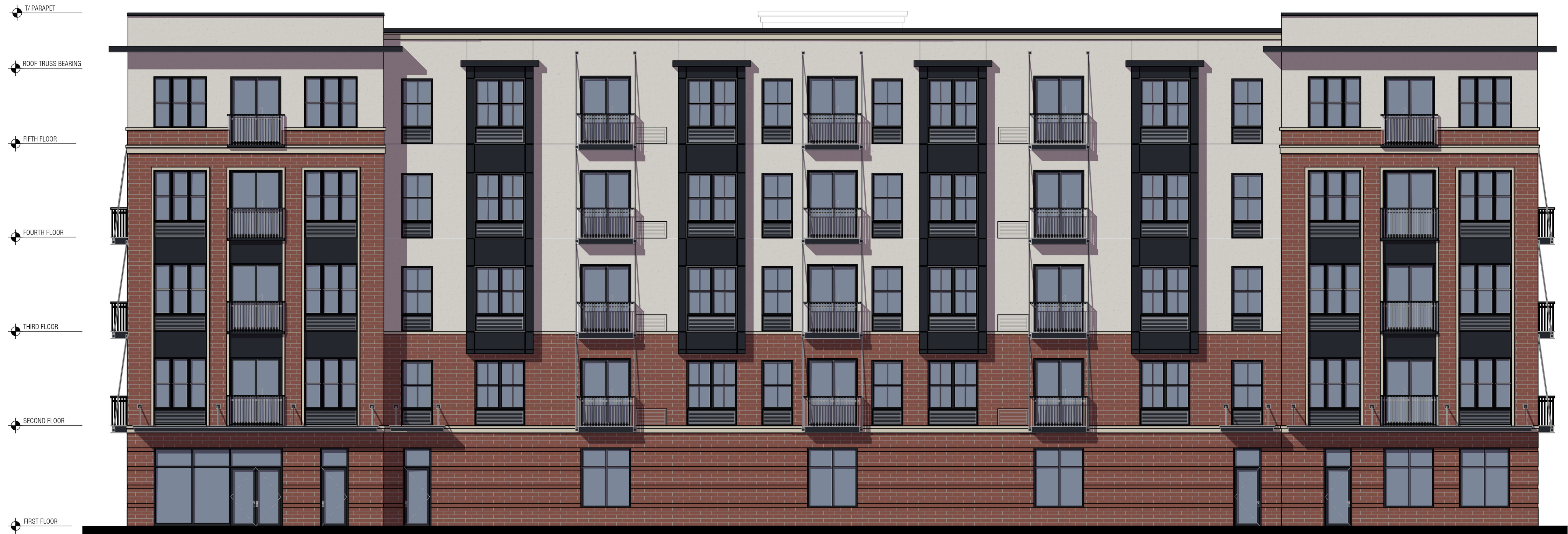
1 REAR ELEVATION SCALE 1/8" = 1'-0"