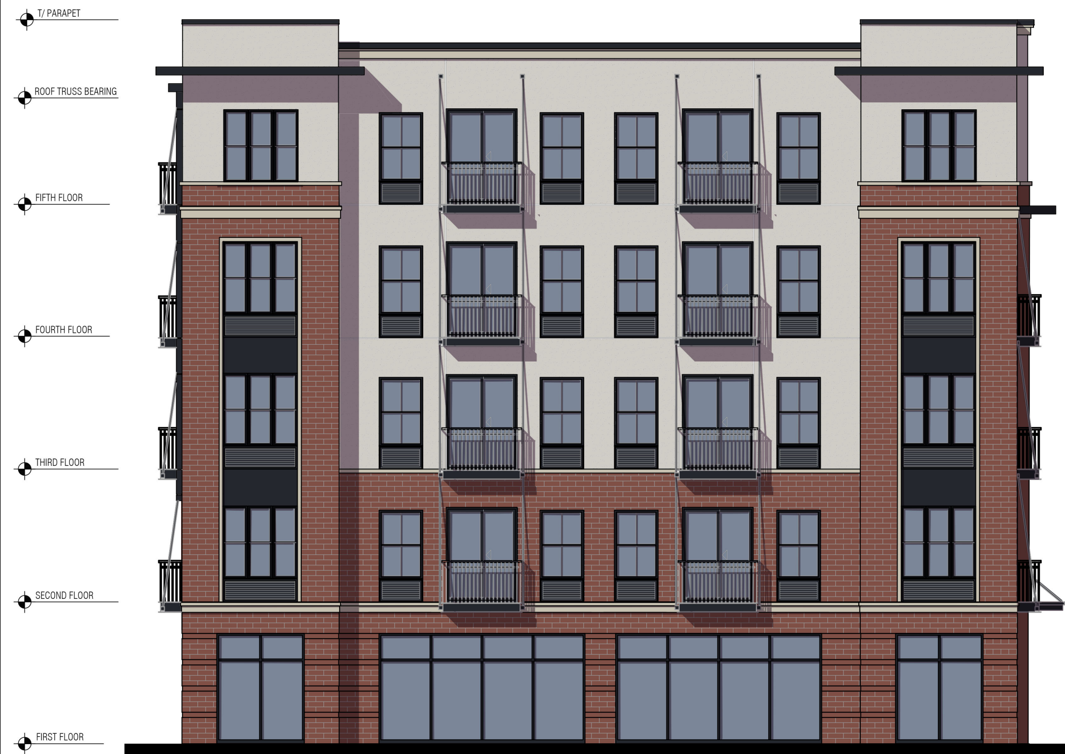
2 SIDE ELEVATION SCALE 1/8" = 1'-0"