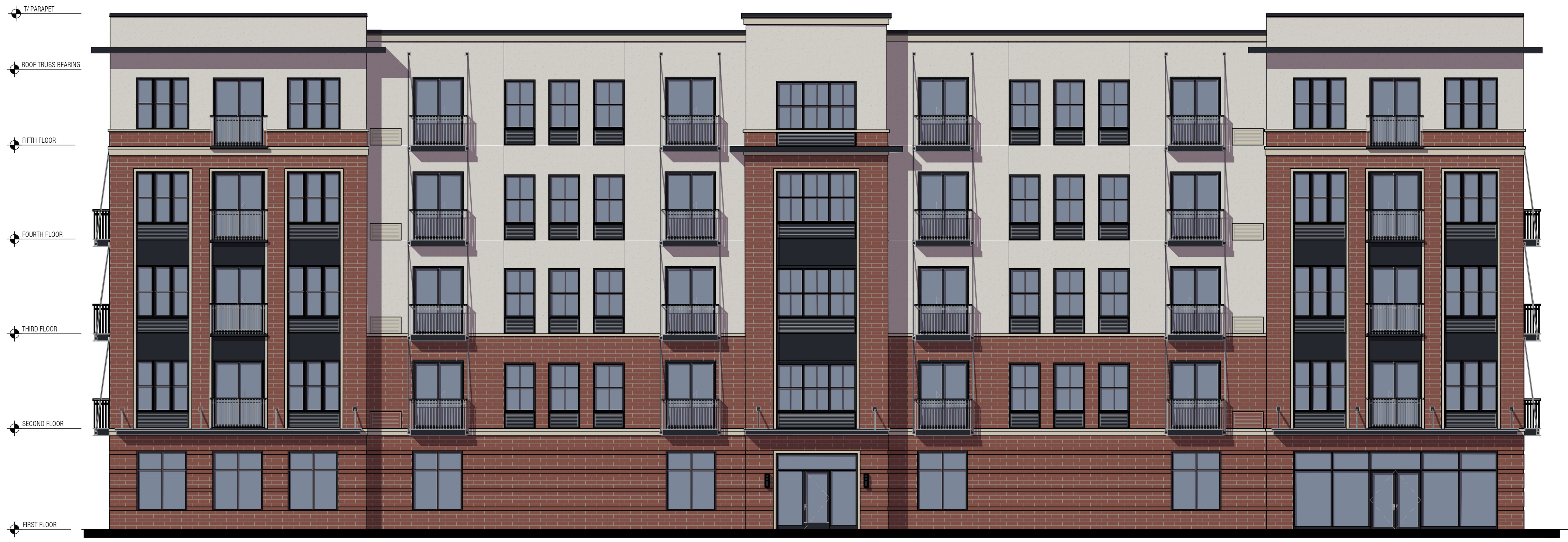
1 FRONT ELEVATION SCALE 1/8" = 1'-0"