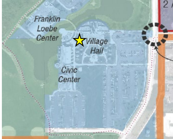
Comprehensive Plan Land Use Map