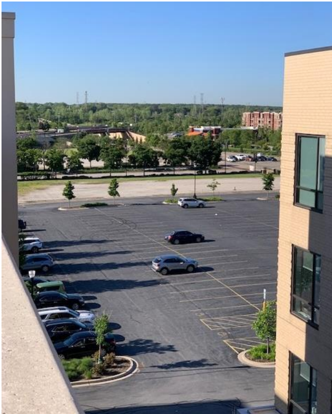
University of Chicago Medicine surface lot in the foreground, eastern edge of the development site in the background; image is taken from the on-site parking structure.

The Development is proposed for a partially vacant site northwest of the LaGrange Road/143 rd Street intersection, adjacent to the 143 rd Street Metra station. The study area is defined for this analysis as the geographical area generally bound by Southwest Highway to the northwest, 143 rd Street to the south, and LaGrange Road (Illinois Route 45) to the east. The study area represents the entirety of the Metra commuter surface lots associated with the 143 rd Street Station, as well as the parking supply and development within a reasonable walk of the station and associated lots. Public on-street parking, the University of Chicago medical office building and surface parking lot, and the Village’s public parking structure are all included within the study area. A map highlighting the project site study area is provided on the following page in Figure 1 .