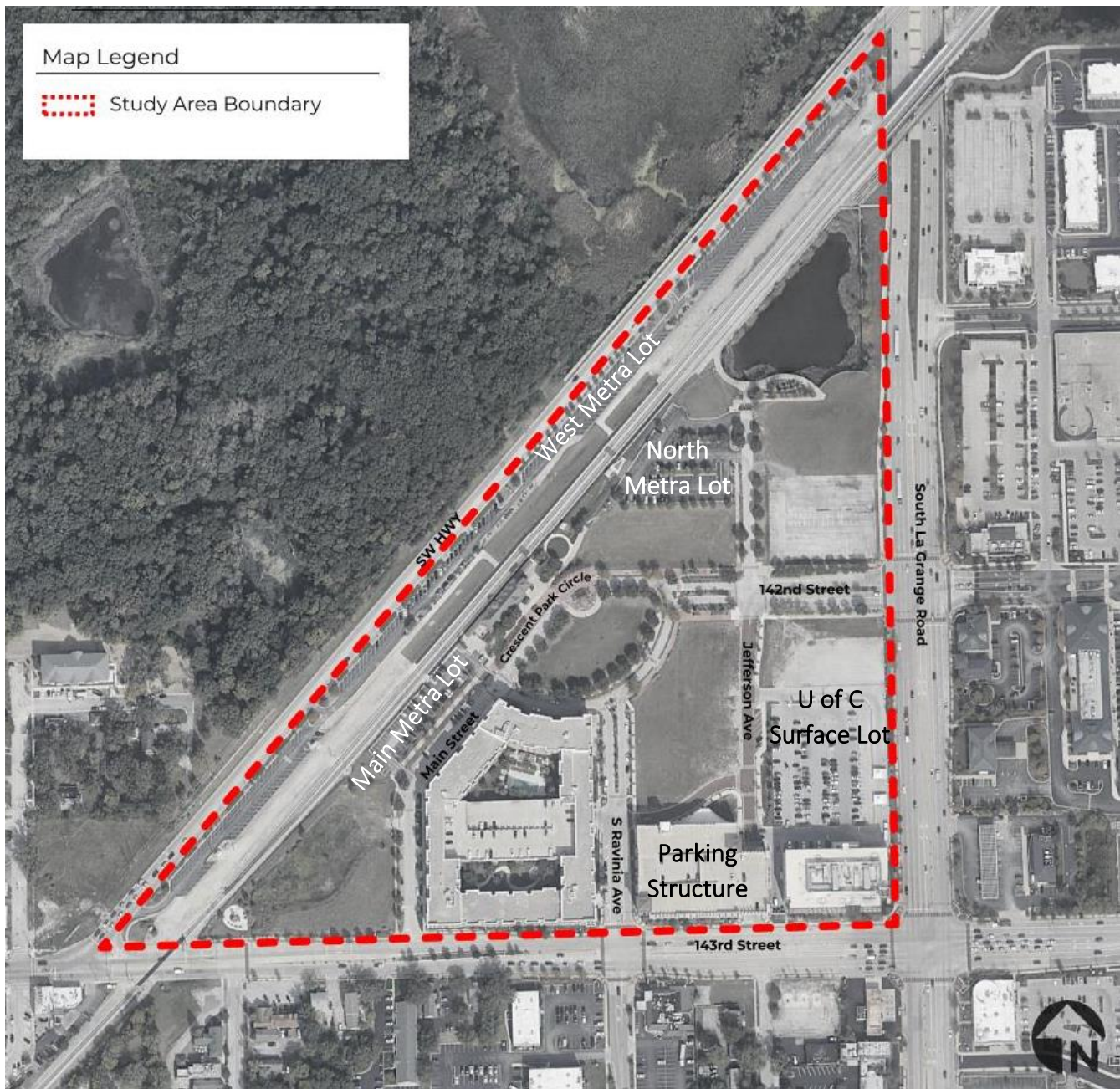
Figure 1. Project Study Area