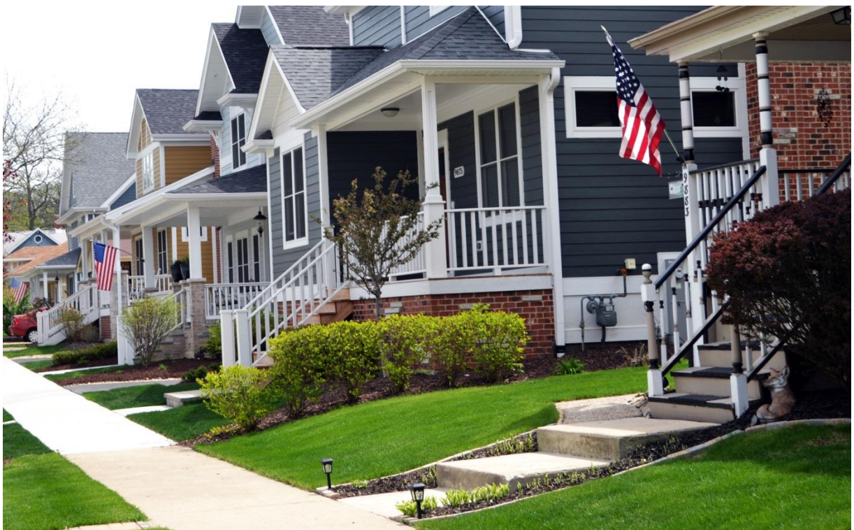
A comparative view of 144 th Place architecture as an example of Old Orland policies at work.