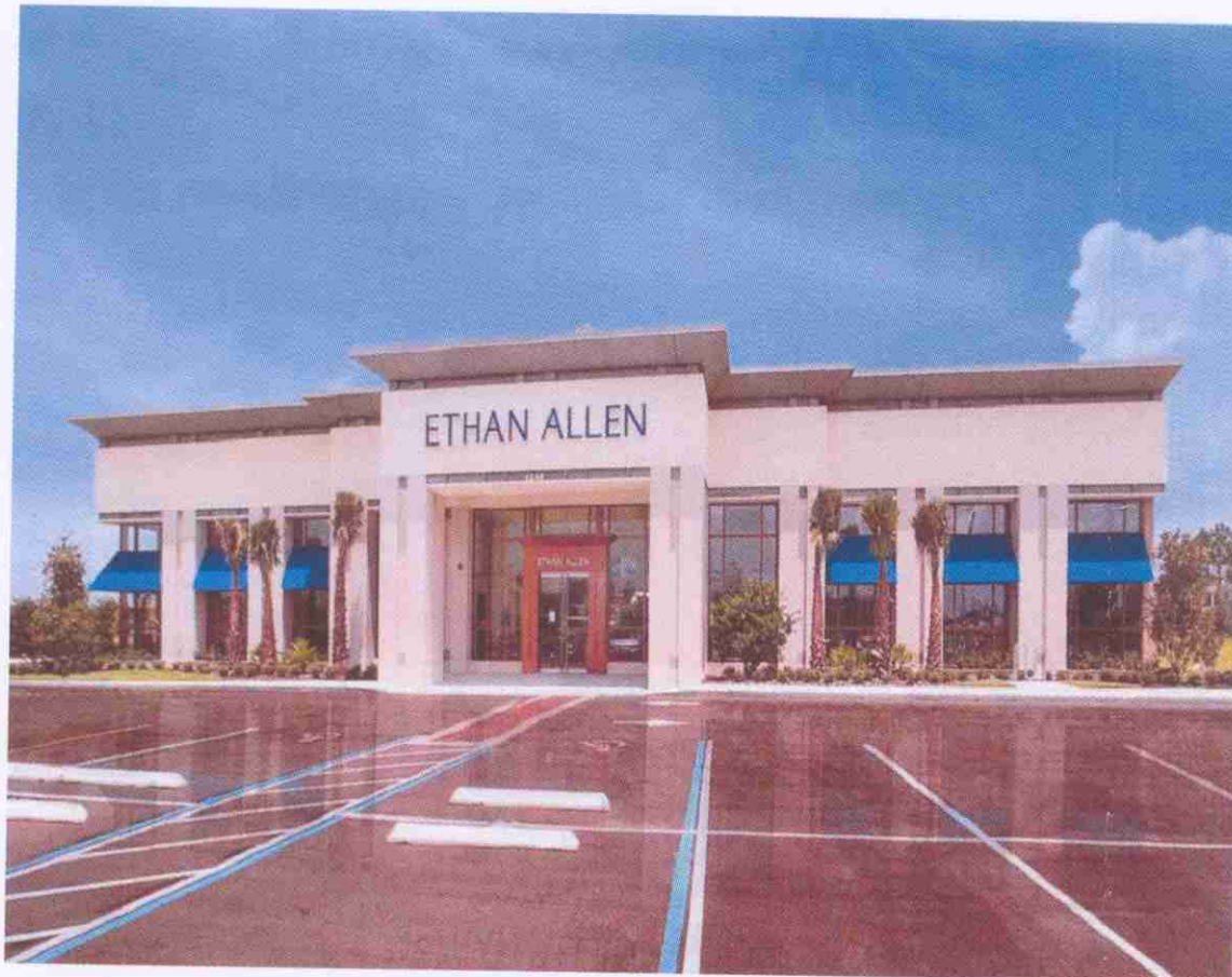
ETHAN ALLEN RENDERING