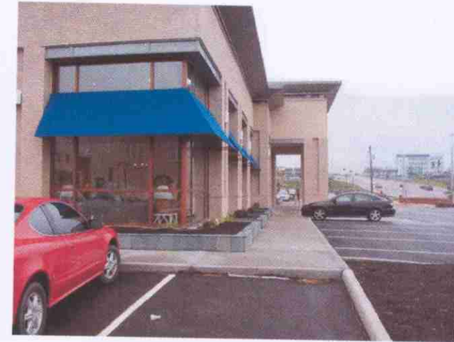
CORNER BUILDING DETAIL