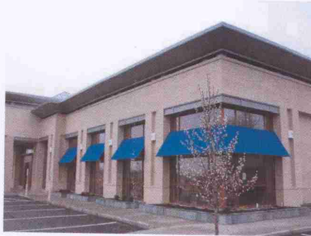
CORNER BUILDING DETAIL