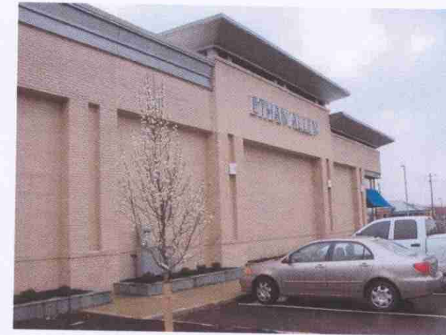
BACK BUILDING DETAIL