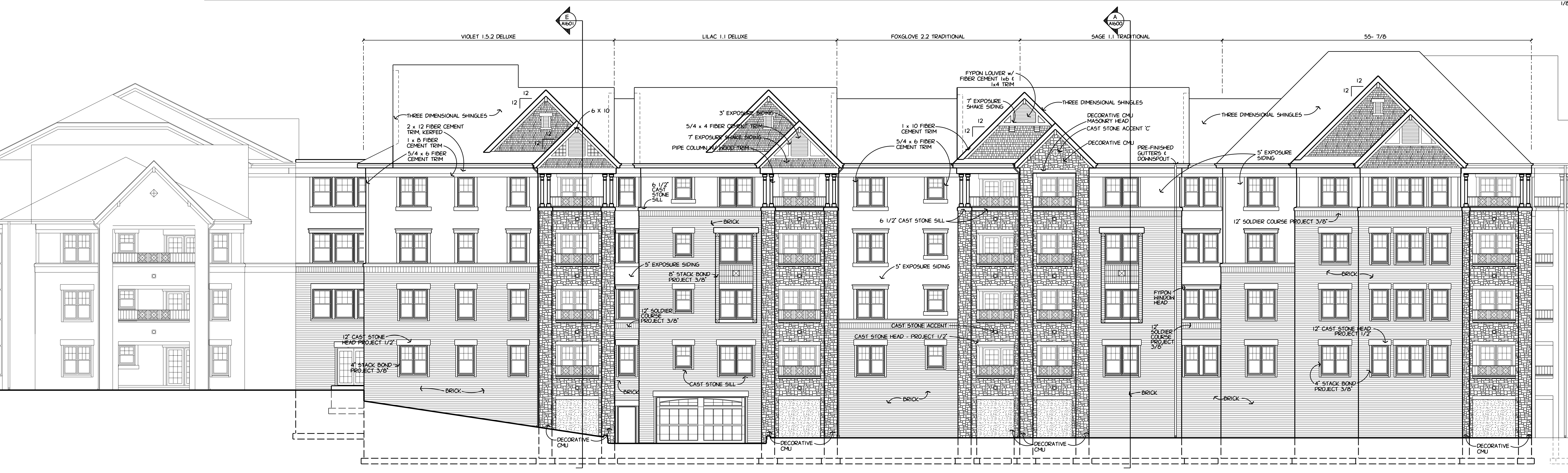
ELEVATION 1/8" = 1'-0"