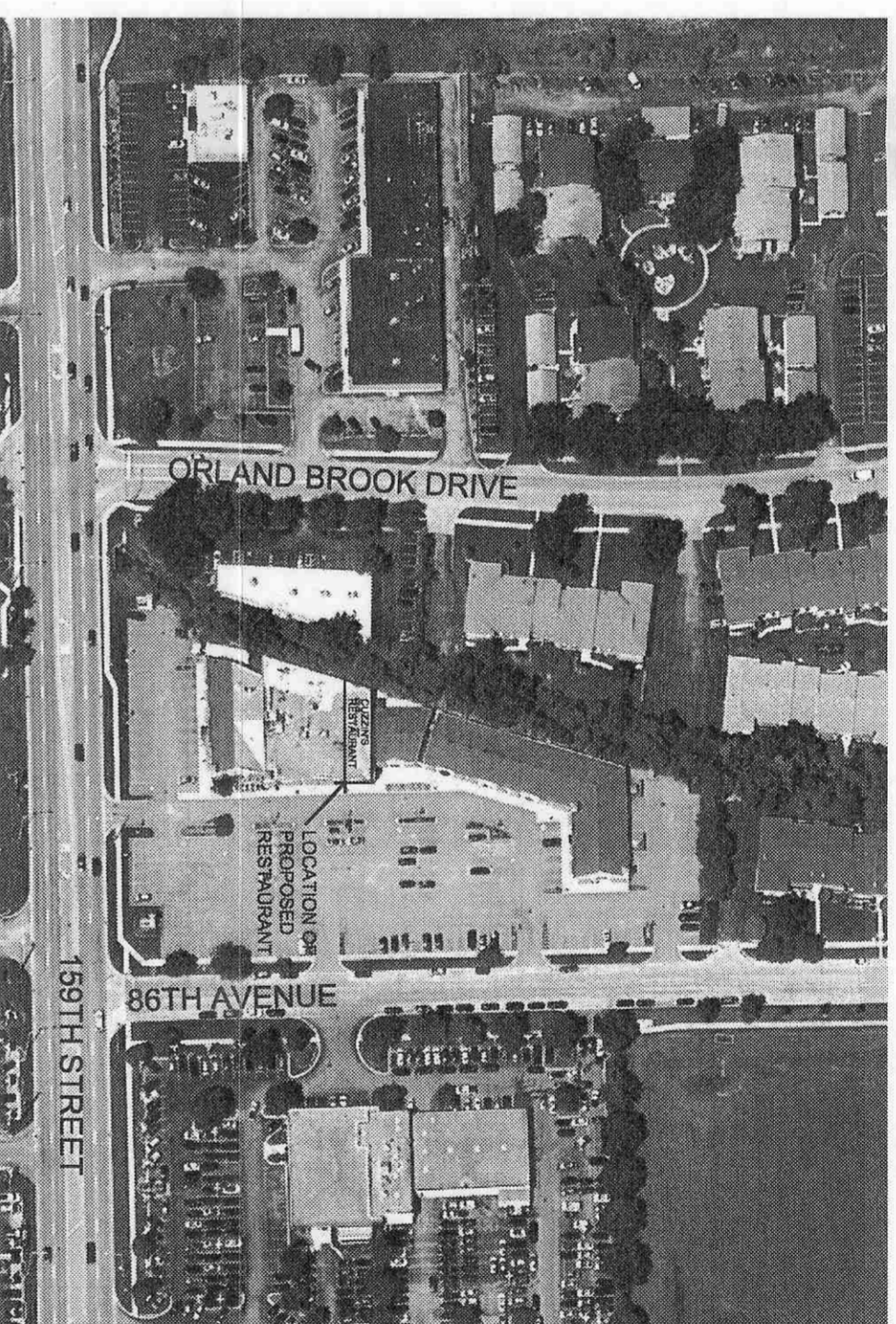
6 PROJECT LOCATION MAP SCALE: NTS

A-1 COVER SHEET FLOOR PLAN SCHEDULES A-2 REFLECTED CEILING PLAN EQUIPMENT PLAN EQUIPMENT SCHEDULE